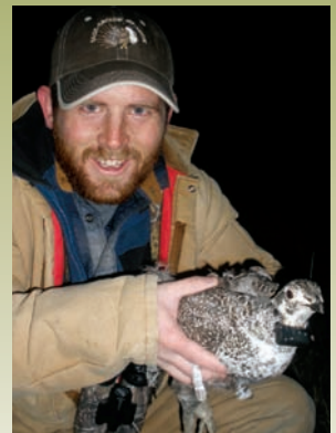
Science field staff releases a radio-collared female sage-grouse.