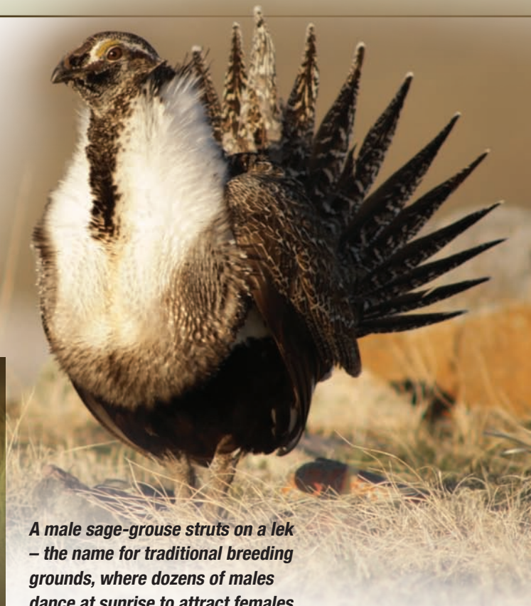
A male sage-grouse struts on a lek – the name for traditional breeding grounds, where dozens of males dance at sunrise to attract females.