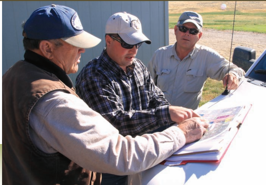
Ranchers and NRCS staff discuss a grazing rotation plan.